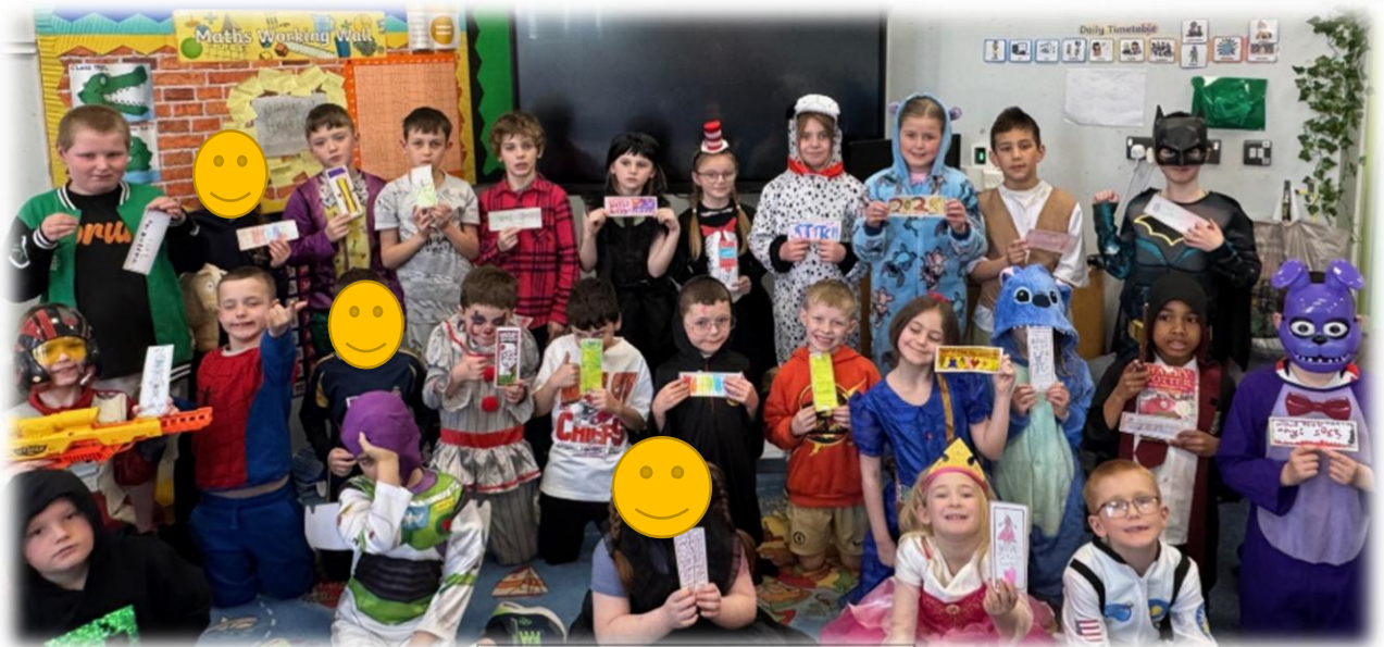
Going for Gold with God