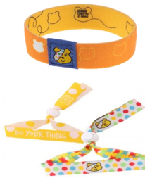
Selection of wristbands £1.00