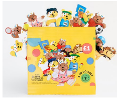
Pudsey Collectables £1.00

This year we will once again be supporting the BBC Children In Need Appeal at Great Wood. We will be selling wristbands, pin badges, Pudsey/Blush Ears and Stationery, at the following prices: