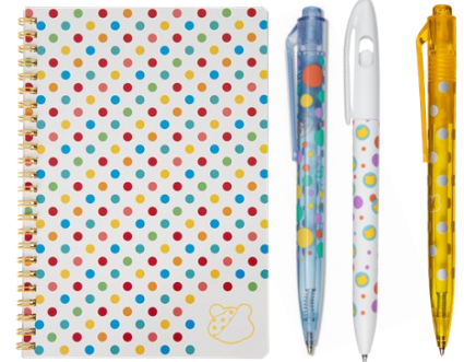
Pudsey Stationery Pens £1 Notepads £2

Our support for charitable causes is as a result of your generosity, however, we appreciate it may not always be easy to make contributions.