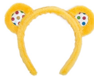
Blush or Pudsey Ears £2.50