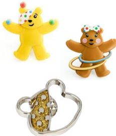
Selection of Pin Badges £1.00