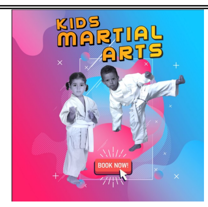
Exciting News! Introducing Martial Arts Explorers for Young Warriors!

J K Martial Arts is thrilled to unveil a fantastic addition to our class line-up – Martial Arts Explorers! This dynamic and engaging martial arts class is exclusively designed for kids aged 4 to 7 years old.